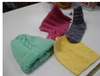
Cable Hat, Seed Stitch Dishcloth, Sock and Beginner's Scarf sample

Learn The Seed Stitch: For new and established knitters. 1 class. Sat, Mar 24: 1-3 pm. $10. Minimum of 4; max of 6 students.